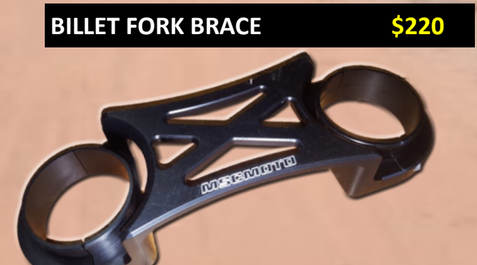
Stop front end flex and twisting in rough terrain by adding a 3rd bracing point in the front suspension

Get more from your DR650 standard front forks with up to 20mm of extra preload to help improve performance